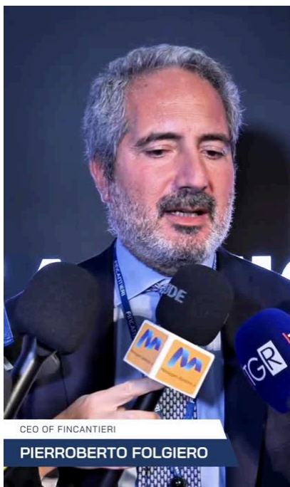
CEO OF FINCANTIERI